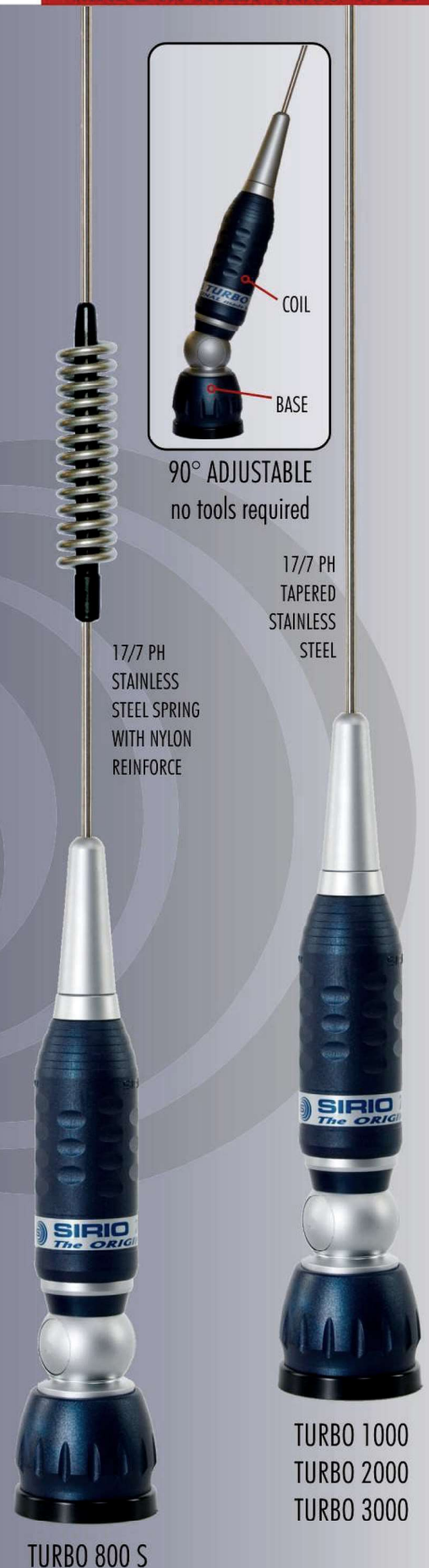
TURBO 800 S

17/7 PH STAINLESS STEEL SPRING WITH NYLON REINFORCE